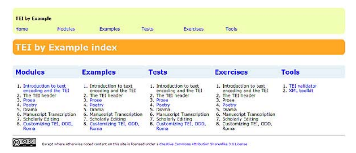
Figure 1: The current TBE home page, providing the user with an overview of the structure and contents of tutorials, exercises and quizzes.

Eight tutorials are under construction. The first, an introduction to text encoding and the TEI, encourages the user to explore textual encoding and markup to foster an understanding of why this is useful, or even necessary, to allow texts to be processed automatically and used and understood by others. The TEI header tutorial covers the type of information and metadata captured in the header element. Three tutorials focus on examples of individual types of text: Prose, Poetry, and Drama, and a further two tutorials deal with examples of Manuscript Transcription and Scholarly Editing. The final tutorial will investigate how the TEI can be customised, and the use of ODD and Roma.